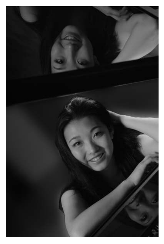
Sunday, January 10, 2010 at 3:00pm

The German Society of Pennsylvania www.germansociety.org