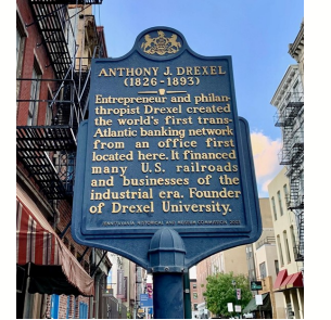
Top: Statue of Anthony J. Drexel on the campus of Drexel University. Bottom: Drexel Marker in Historic District, Philadelphia.