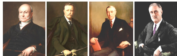
The four U.S. presidents who mastered the German language; from left to right: John Quincy Adams, Theodore Roosevelt, Woodrow Wilson, Franklin Delano Roosevelt

Serving from 1825 to 1829, President John Quincy Adams earned both bachelor's and mas-